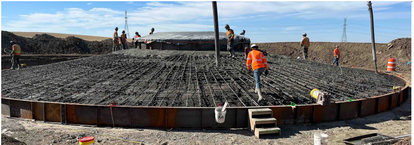
T7 Foundation Concrete Pour // Alberta